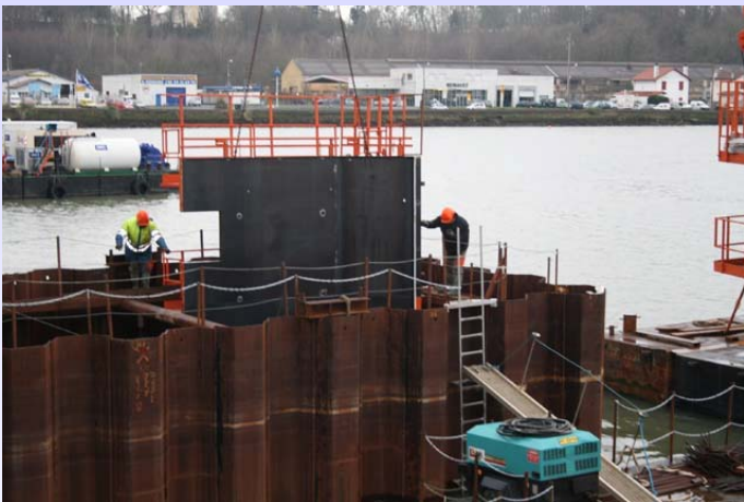
Position of the scaffolding to P7 stack elevation