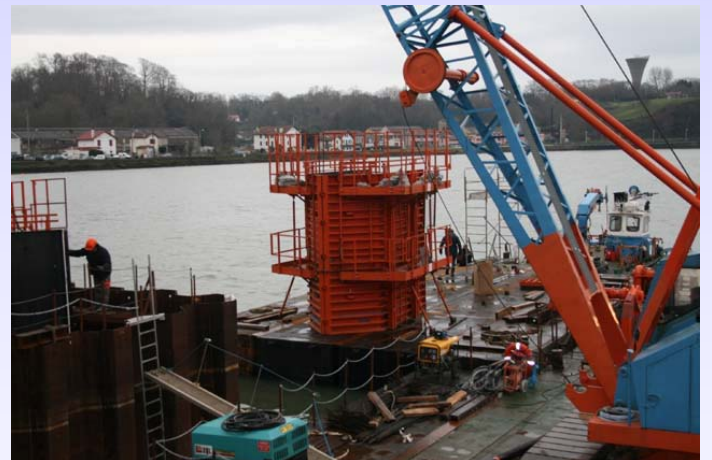
Formwork on the barge waiting for putting the embankment